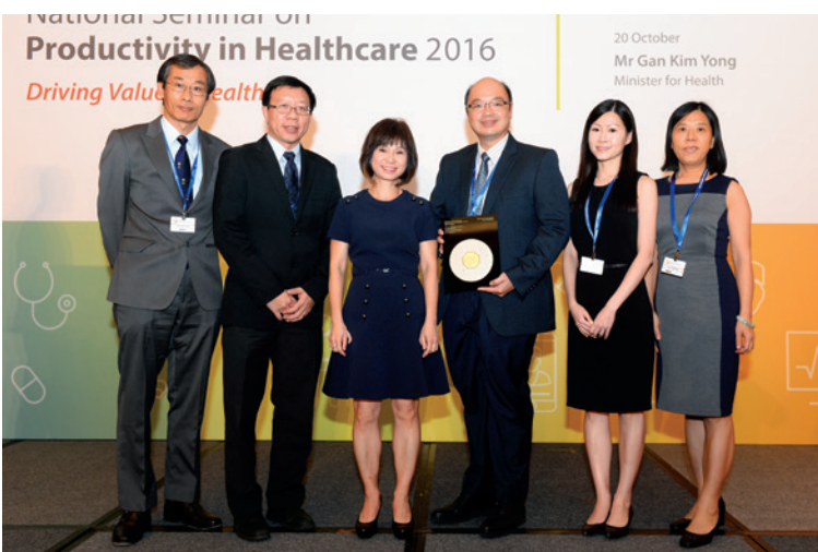
The NUH-St Luke's Hospital Integrated Care project team together with Dr Amy Khor, Senior Minister of State, Ministry of Health and Ministry of the Environment and Water Resources (third from left).